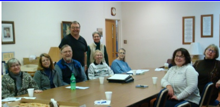
2019 Brainstorming Session (above)